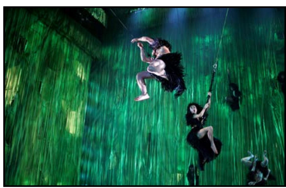
Original Broadway Cast

During "Strangers Like Me," Tarzan teaches Jane to "fly" by sweeping her up into the jungle canopy. You can accomplish this feat without rigging either actor. Construct a one-level platform that can easily roll on and off stage and paint umbrellas to represent jungle leaves and flowers. With Tarzan and Jane atop the platform, have the ensemble surround the pair with open, undulating umbrellas and move across the stage, varying levels.