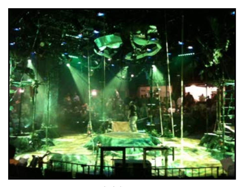
Wagon Wheel Theatre, Warsaw, IN

In the natural world, the sun and moon have a difficult time penetrating the thick jungle canopy. On Broadway, Natasha Katz used fractured lighting – exciting color flashes that found their way through the stylized trees and plants. Shadows played a big role, as did the warm colors of daytime contrasted with the cool colors of night. Only in a rare jungle clearing (the opening of Act 2 in the human camp) was there a brighter and more general lighting given to the stage.