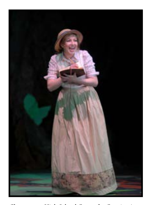
Chattanooga High School Center for Creative Arts, Chattanooga, TN

The Library of Congress's directory for online clips of period dance. Each clip also features a link to its instruction page in the dance manual from which it is taken.