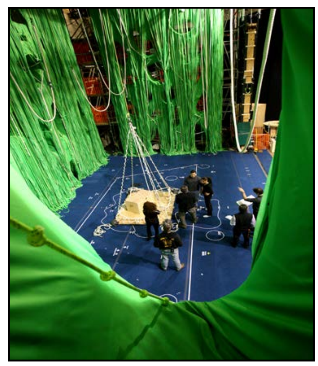
Aerial rehearsals at Steiner Studios, Brooklyn, NY

The original concept of the show was to place a naturalistic acting performance into a stylized setting. These are not meant to be presentational, musical-theater characters; rather, they are slightly heightened, detailed personalities to be performed with subtlety and realism. Sometimes the easiest note to give is that the performers are acting for a camera, not a 2000-seat theater. The audience must be invited to the stage – drawn into the story to take the journey with the actors. In order to have a satisfying emotional experience at the end of the show, the audience must be participants every step of the way, not just spectators.