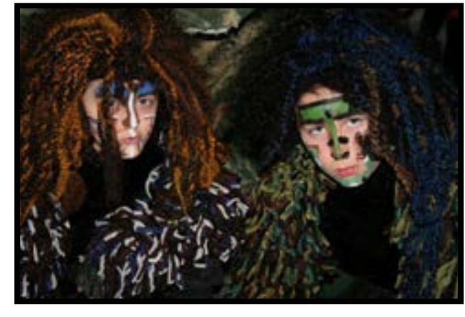
Bradford High School. Kenosha, WI

KALA: Add motherly colors, such as purple or warm browns, to her hair and layered fabric.