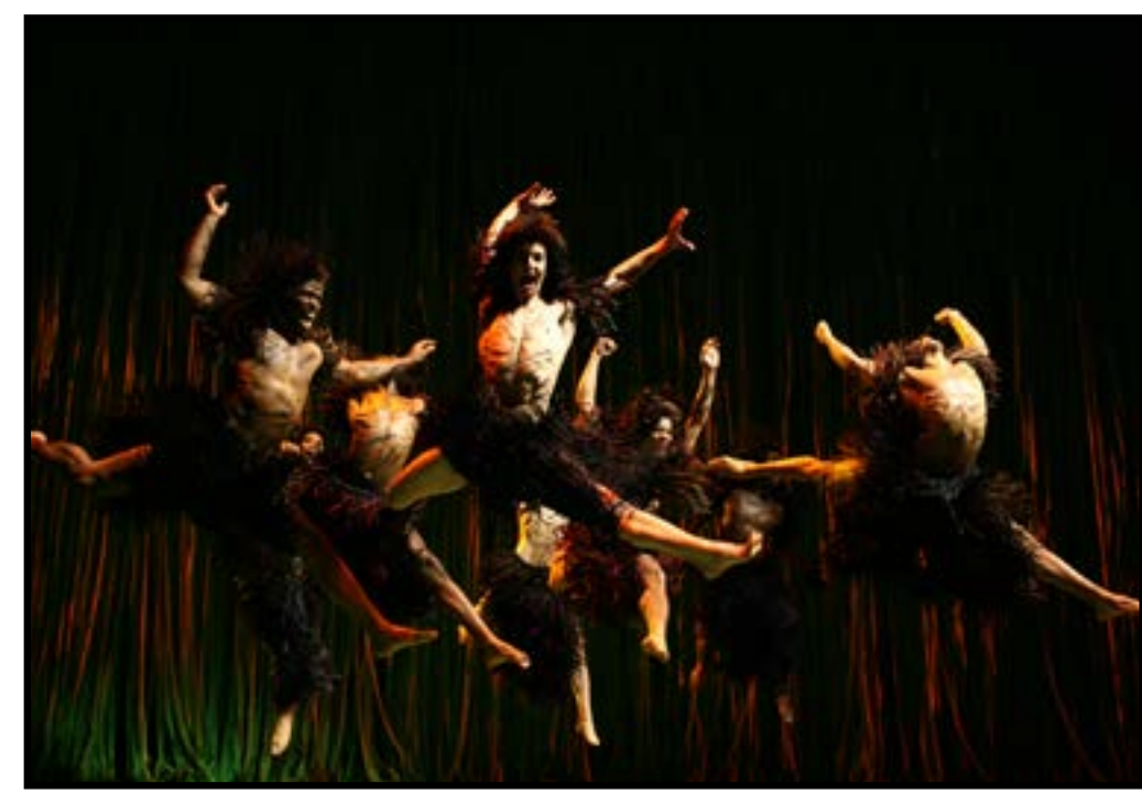
Original Broadway Cast

Tarzan joined the collection of Disney musicals in the Music Theatre International (MTI) catalog in 2012. This Production Handbook, which includes insight into Disney's development and production process and recommendations from licensed pilot productions, has been compiled by the staff at Disney Theatrical Group to help support dynamic and engaging new productions of the show.