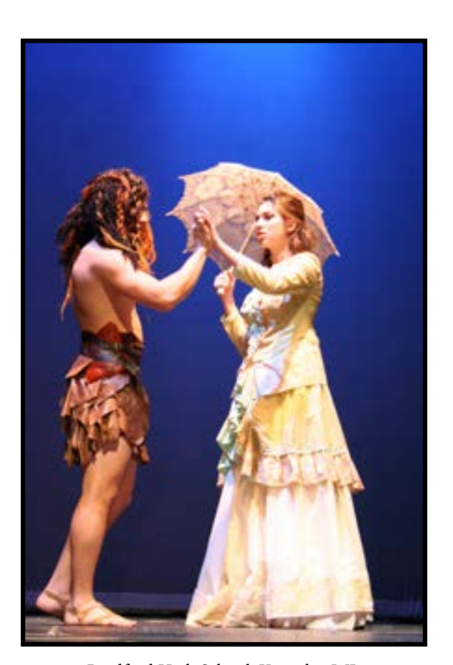
Bradford High School. Kenosha, WI.

EXPEDITION CREW: A mixture of brown, green, or khaki pants or shorts with boots and various combinations of shirts and vests. Options: suspenders, jackets, safari hats, hunting weapons, neck kerchiefs or water canteens.