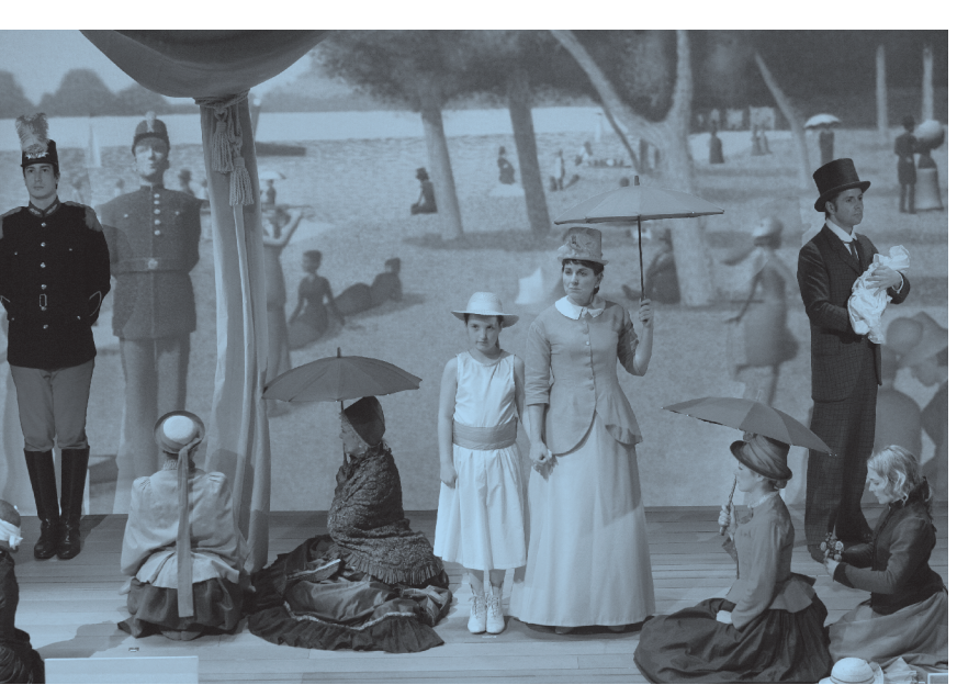
Cast from the West End production of Sunday in the Park with George.

Allegorical-when one thing represents another, often a spiritual reference. Ambient-describing the qualities of the surrounding area or environment Bustle-a fashionable trend of gathered fabric at the back of a woman's dress Elliptical-oval shaped Fruition-accomplishment, completion Gavotte-an old French dance, or the piece of music that accompanies it Pastoral-simple, charming, or serene Mademoiselle-the French word for "miss" Monotonous-unchanging, boring Monsieur-the French word for "sir", or "mister" Neo-Expressionism –a style of painting in which the artists returned to portraying identifiable objects including the human body, in opposition to minimalism. Nouveau-the French word for "new" Nuance-a subtle difference in meaning or expression Placid-undisturbed, calm, quiet Satirical-something that makes an ironic joke Simpering -shy, delicately flirtatious