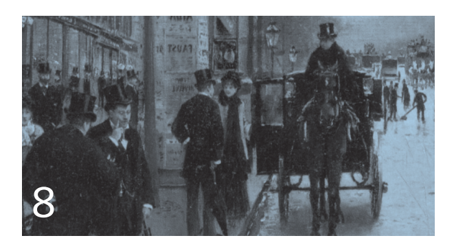
CONNECTION through History: The World of the Play