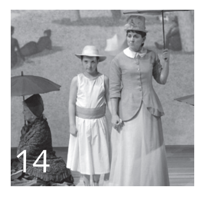
CONNECTION through Language: Vocabulary