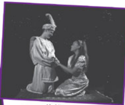
Aladdin JR. North Shore Youth Theatre at Dunham Woods, MA